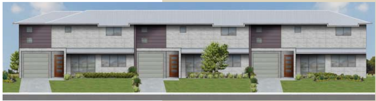
TYPE C FACADE