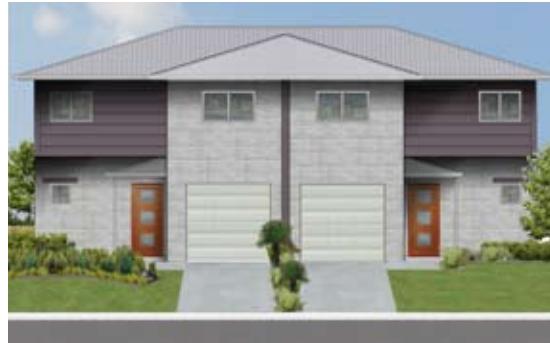
TYPE B FACADE