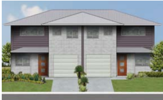
TYPE A FACADE