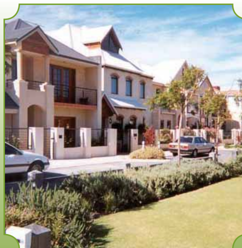
Proposed building style Stage 5