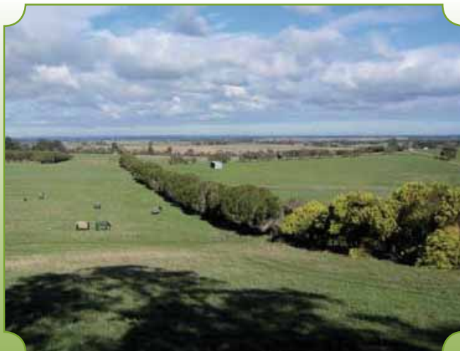
View to the south

T he 428 lots to be released in nine stages, have easy road access to Melbourne and central Pakenham. Many blocks have outstanding views from all sides of the estate no matter what stage you purchase. The new primary school will be built on the estate with easy access to secondary schools. Several childrens' play parks and the community center will enable many activities to be available for residents.