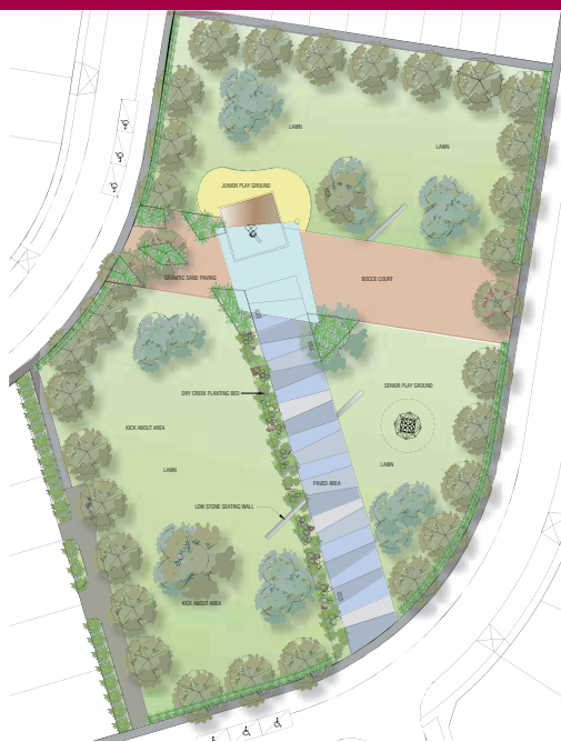
RESERVE STAGE SIX "VILLAGE GREEN"