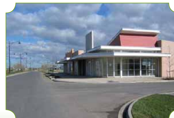
Nearby Lakeside retail