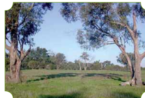
View to the North East