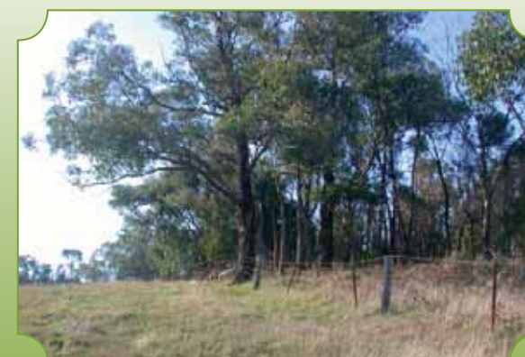
Bushland bordering Stages 8 & 9